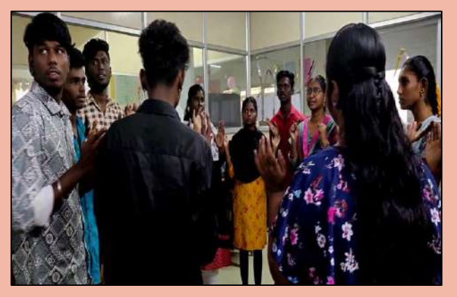
mutual respect and intellectual stimulation.

accurate guidance, empowering them to navigate various situations with confidence."